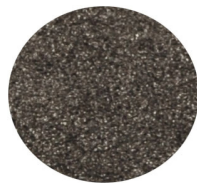
High density foam